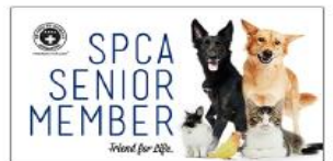
Standard Senior Member's Card