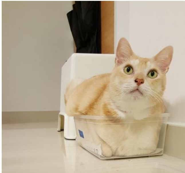
Jojo in the most comfortable box in the room